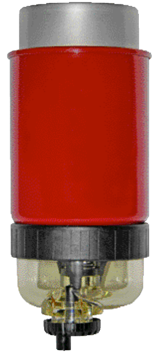
Baldwin Filter Fuel/Water Separator with OE Bowl