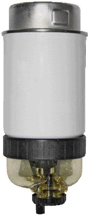
OEM Filter Fuel/Water Separator